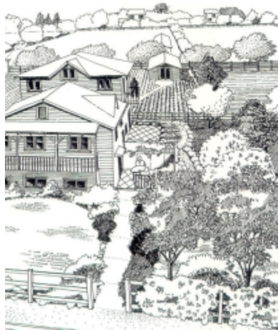
View of large-lot houses with truck farms in the rear.