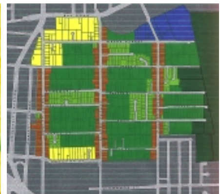
New zoning would preserve farms and encourage density along side streets.