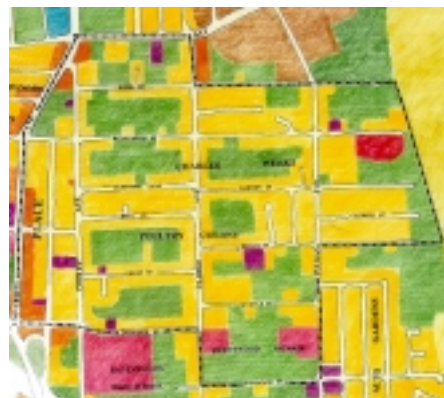
Existing land uses: farms and gardens in the center of lots.