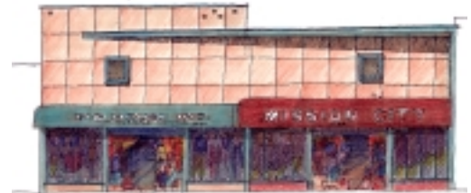
Façade improvement guidelines: new paint, awnings, signage, and storefront lighting.